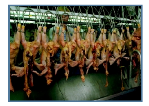
Many birds are slaughtered while fully conscious.