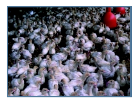
A Factory-farmed turkeys are constantly confined in warehouse-type sheds holding tens of thousands of birds.