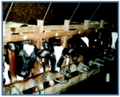
A Veal calves are constantly confined in small crates that restrict virtually any movement.