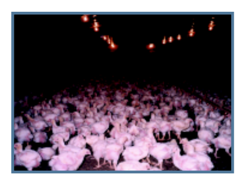
A Nearly all of the chickens we eat (called "broilers") are kept tightly packed in sheds without access to the outdoors.