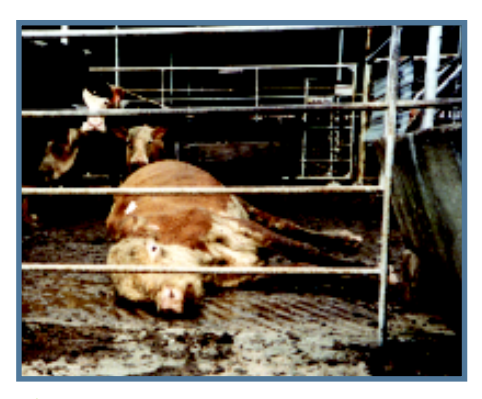
A downed cow is left to suffer and die at a stockyard as her frightened calf looks on.