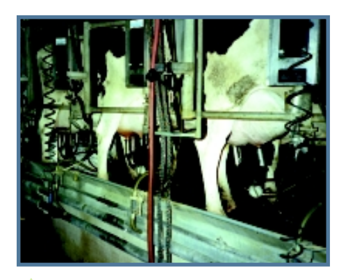
Artificially inseminated cows are pumped full of drugs to increase milk production.