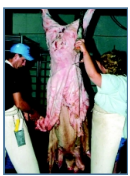
At slaughter, pigs are hung upside down and have their throats slit.