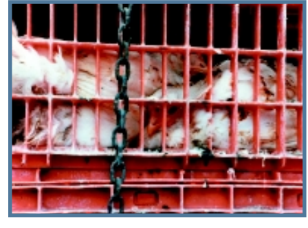
A Birds are sent to slaughter in multi-tiered transport trucks that do not have adequate protection from intense heat or cold. They are denied any food or water during the trip.

At slaughter, they're torn from the crates and shackled upside down onto automated metal racks. Some birds are stunned in electrified baths, but most are left conscious, yet paralyzed. Those who are stunned often regain consciousness before their throats are slit and end up being immersed alive in tanks of scalding water that de-feather their bodies.