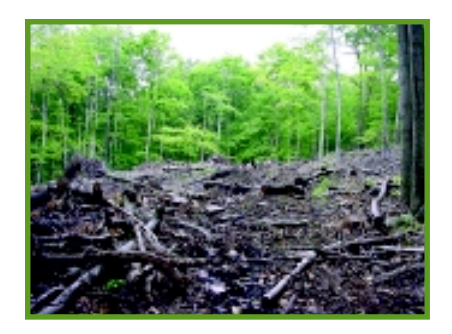
Millions of acres of forests have been clear-cut to provide grazing land for cattle.