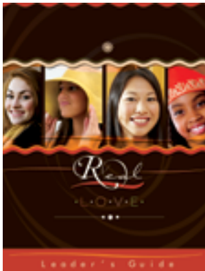
Real Love Leader's Guide with CD $14.95

Each leader's guide includes step-by-step instructions, a complete leader's script, a PowerPoint presentation and sample participant's journal on CD, sample schedules, activities, ideas for decorations and giveaways, recommended resources, and more.