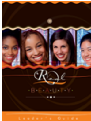
Real Beauty Leader's Guide with CD $14.95