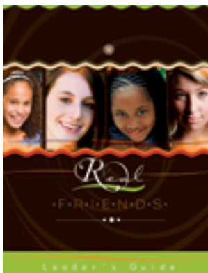
Real Friends Leader's Guide with CD $14.95