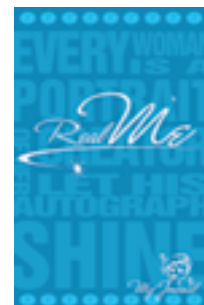
Participant Journal (Pack of 10) $9.95