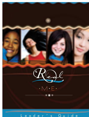
Real Me Leader's Guide with CD $14.95