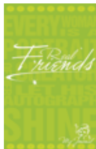
Participant Journal (Pack of 10) $9.95