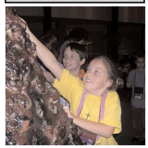
Gladstone Park, OR

~adapted from Northern Asia-Pacific Division News &Views