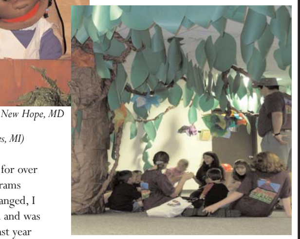
Chapel Haven, CO