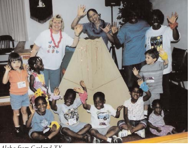
Aloha from Garland, TX

I had mothers come up and specifically thank us for doing VBS. One mother, with tears in her eyes, thanked us over and over.