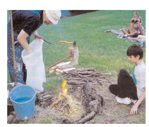
Vacation Bible Camp in Flint, MI

I love the way each station emphasizes the Bible point and how they all flow together. Also, the daily challenge was a GREAT addition.