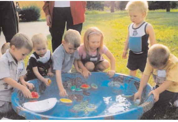
Preschool fun in Brainerd, MN

The music was great! We had so much fun during the Lava Lava Luau and Sing and Play Bay. I had older boys actually singing loudly and participating. Wow! Everyone had fun during this