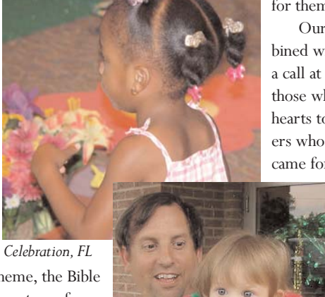
"Lei it on!" Gastonia, NC

It was all organized for me; things were easy. I