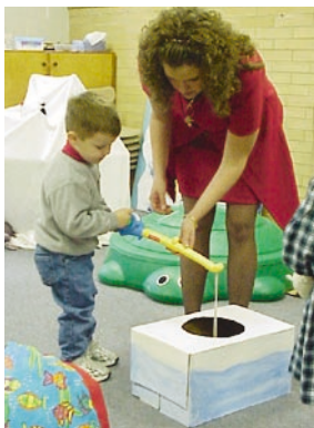
"Ice fishing" is a big hit.

"I was able to answer parents' questions positively, and assure them that this program encourages discovery and