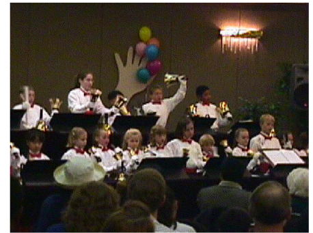
Members of the Mile High Academy Elementary Ringers